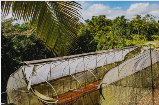
Sustainable agriculture initiatives which feed residents and staff, as well as local communities.

Mustard Seed Communities (MSC) is a non-profit organization founded in 1978 in Jamaica, dedicated to empowering and enriching the lives of the spiritually, psychologically, and financially poor. Registered as a charitable organization in July 2014, MSC operates from 1 Mahoe Drive, Kingston 11, with the support of 13 board members and around 1,000 volunteers both locally and internationally.