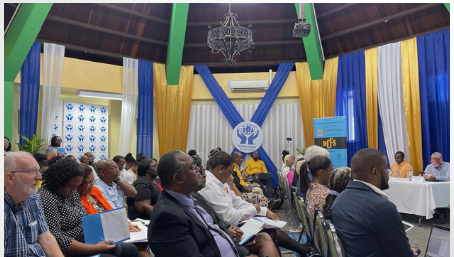
Charities Sensitization Session held on February 21, 2024

Six (6) Workshops and Sensitization Sessions have been held using a mix modality of lectures and workshops.