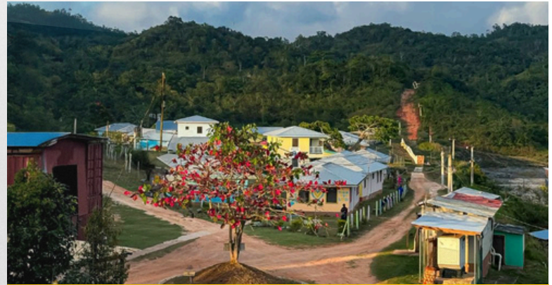
Jacob's Ladder is an expansive home in the mountains of Moneague, Jamaica dedicated to lovingly shelter adults with disabilities for a lifetime.

The organization runs various initiatives, including the first urban-based community radio station in the English-speaking Caribbean, 96.1 MHz, offering programs on human rights, conflict resolution, health, and youth empowerment. Additionally, MSC operates a Pottery Studio, enhancing self-esteem and manual skills through arts.