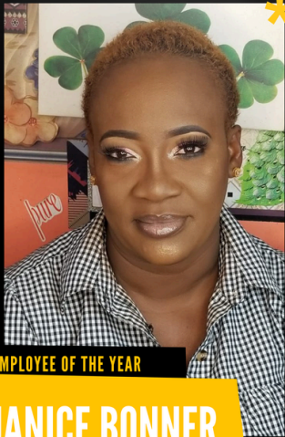
EMPLOYEE OF THE YEAR

The following officers were awarded at the Ministry's 2023 staff awards and recognition function