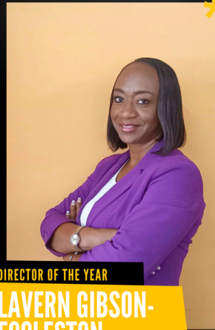
DIRECTOR OF THE YEAR