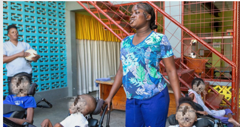
Trained caregivers give more than just their skill to care for the health of children – they give from their heart.

The organization runs various initiatives, including the first urban-based community radio station in the English-speaking Caribbean, 96.1 MHz, offering programs on human rights, conflict resolution, health, and youth empowerment. Additionally, MSC operates a Pottery Studio, enhancing self-esteem and manual skills through arts.