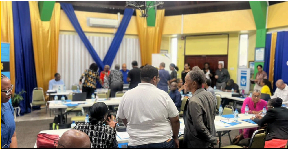
RCO Representatives engaged in discussion at the workshop held March 20, 2024.