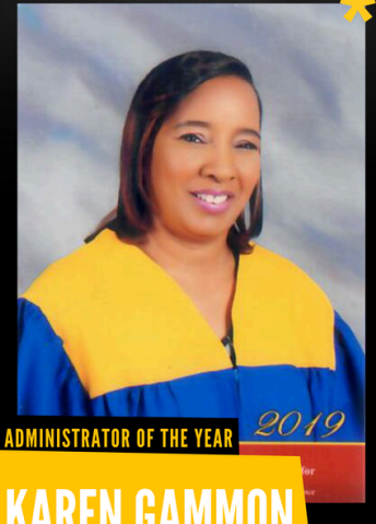
ADMINISTRATOR OF THE YEAR