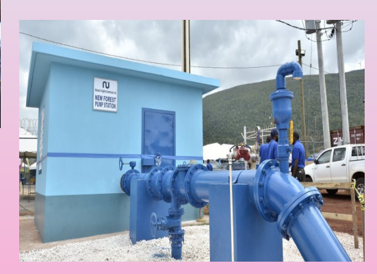
New Forest Pump Station

The launch of such a System into service will provide a consistent and stable water system for some 497 farmers who are integral in terms of the development and sustainability of the Agricultural Sector.