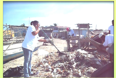
Beach Clean-up activities at Old Harbour Bay Fishing Village

The event was a successful one, as garbage of different shape, size and descriptions was removed from our sea shores.