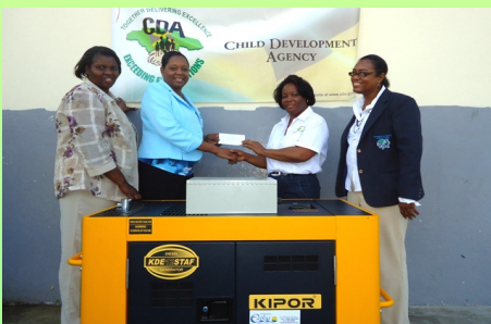
CDA/CDC Joint Donation being made to Homestead Place of Safety

Celebration of the IYC in Jamaica came to an end with "a ray of hope" for the girls at the Homestead Place of Safety and the Manning Boys Home. The girls at the Homestead Place of Safety received a much needed gift in the form of a generator provided through a joint effort of the Child Development Agency (CDA) and the Co-operative Development Committee (CDC). The generator, which valued at some $318,000, was presented in December, 2013 to the Place of Safety.