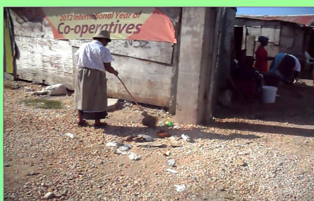
Beach Clean-up at Rocky Point Fishing Village

As part of IYC a beach clean-up was organized in keeping with the International Coastal Clean-up week.