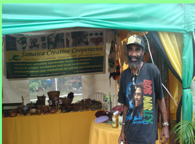
Members of Jamaica Creative Co-operative Society displaying items at Denbigh 2012.

Over the years, the Department has participated in the Annual Denbigh