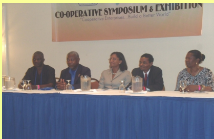
Panel of Symposium and Exhibition.

Symposium and Exhibition during the period July 18-19, 2012 at the Sunset Jamaica Grande, Ocho Rios.