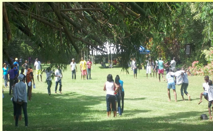
Participants at the Fun Day at Cranbrook Estate

On July 7, 2012 various cooperators and their families could be found on the grounds of the Cranbrook Estate where a Fun Day event was hosted as part of the IYC celebrations. The day was one well spent and involved several energetic and innovative activities which sparked enthusiasm, team building and co-