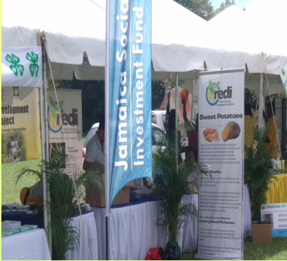
Display of Root and Tubers at the Exhibition.

event was commemorated with the hosting of a National Ceremony and Exhibition and a Roots and Tuber Fest on October 12 and 16 respectively.