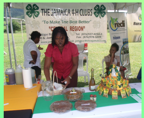
Jamaica 4H Club displays items made from Roots and Tubers.

“Grow what we eat, eat what we grow” for several years has been the guiding principle on which the Jamaican Society seeks to ensure food security. The need for food security is a worldwide one and consequently “World Food Day” which is celebrated October, 16 of each year is one endorsed by the Nation.