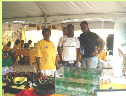
DCSF Representative (Right) and members of Bucknor Concern Citizen Association Benevolent Societies displaying their craft at Denbigh 2012.

Agricultural & Industrial Showcase as a means of disseminating information on the work of the Movements and the Department to the approximately 80,000 patrons who normally participate in this three (3) days event. As a part of the International Year of Co-operatives celebrations, the Department along with various Co-operative Enterprises during the period August 4-6, 2012 participated in one of the most prestigious exhibition within the Caribbean in a bid to further promote the co-operative concept as a viable sector of the country.